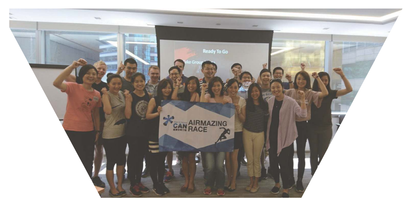
28 June 2017 Airmazing Race with Swire

Aiming to raise awareness and interest towards the surrounding environment, as to prompt the use and application of the concept of sustainable development, and to contribute to the alleviation of air pollution in Hong Kong.