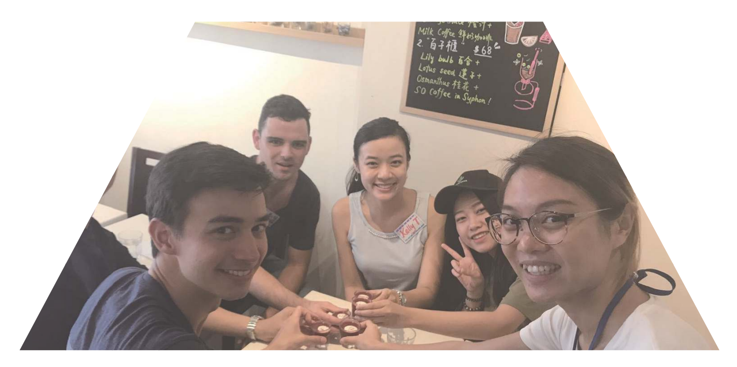
12 May 2017 Swire Sustainability Development Treasure Hunt with Swire

Aiming to raise awareness and interest towards the surrounding environment, as to prompt the use and application of the concept of sustainable development, and to contribute to the alleviation of air pollution in Hong Kong.