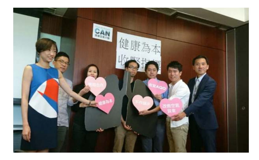
26 June 2017 AQO Review Press Conference

CAN, with 6 LegCo Members, reviewed the AQO document and emphasized the measures should prioritize public health. CAN urged for wellcoordination between Environmental Protection Bureau and Transport and Housing Bureau in order to achieve an effective solution to improve roadside pollution and thus safeguarding public health.